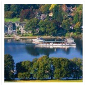
The Lakeside Hotel. Lake District