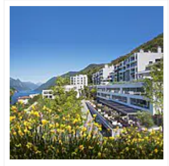
The View Lugano. A Heavenly perch and