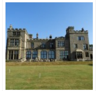
Armathwaite Hall Hotel & Spa.