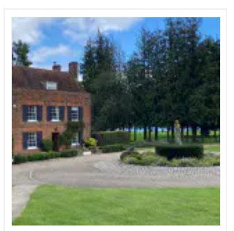
Delicious Auberge du Lac.