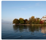
Park Weggis Hotel