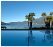
Hotel Eden Roc