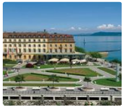
Beau Rivage Hotel Neuchatel